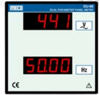
DU-96(V + Hz)