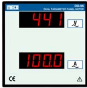
DU-96(V + A)