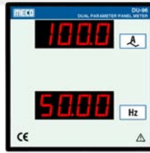
DU-96(A + Hz)